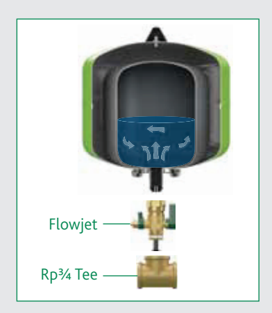
C € marked